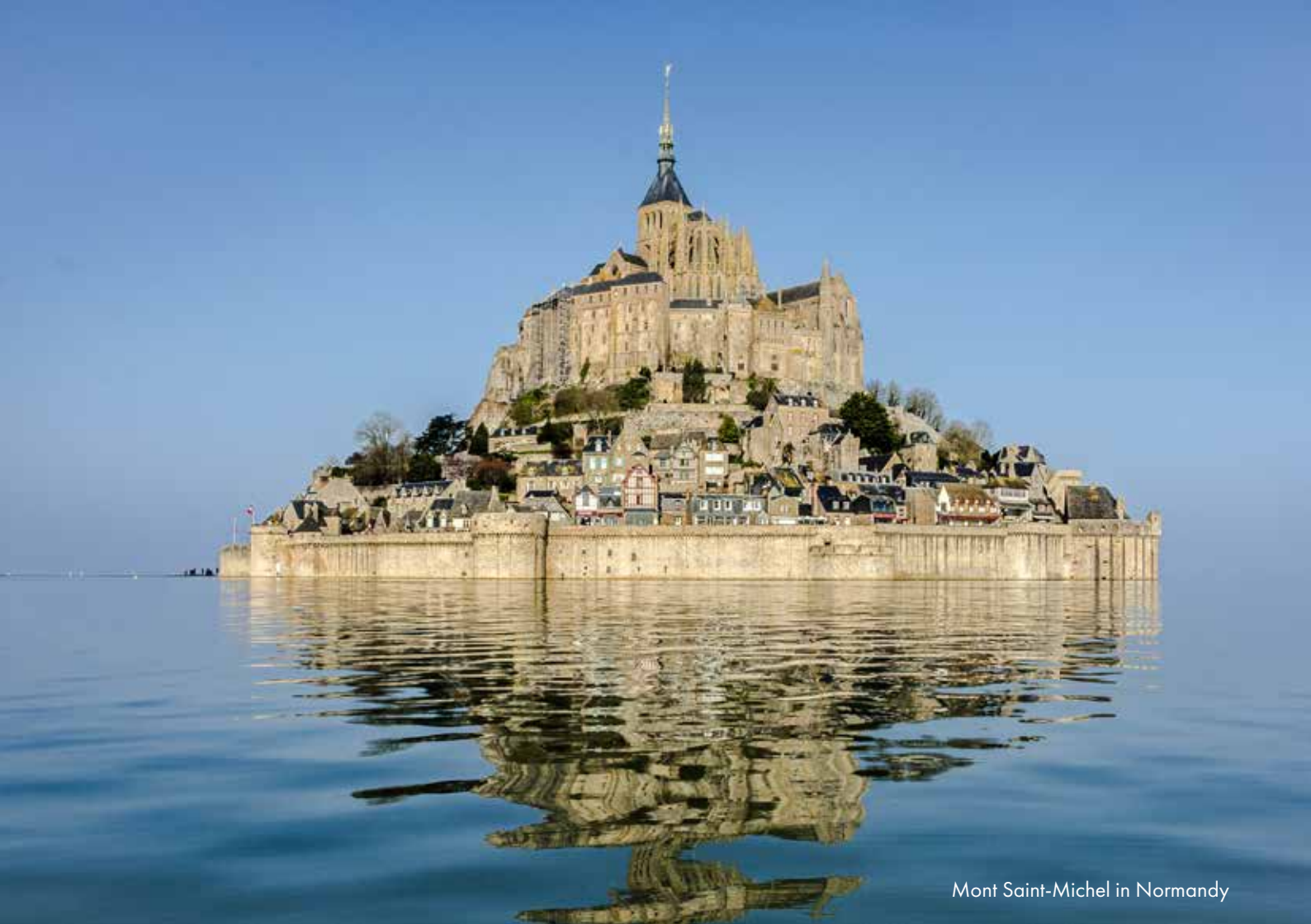
Mont Saint-Michel in Normandy