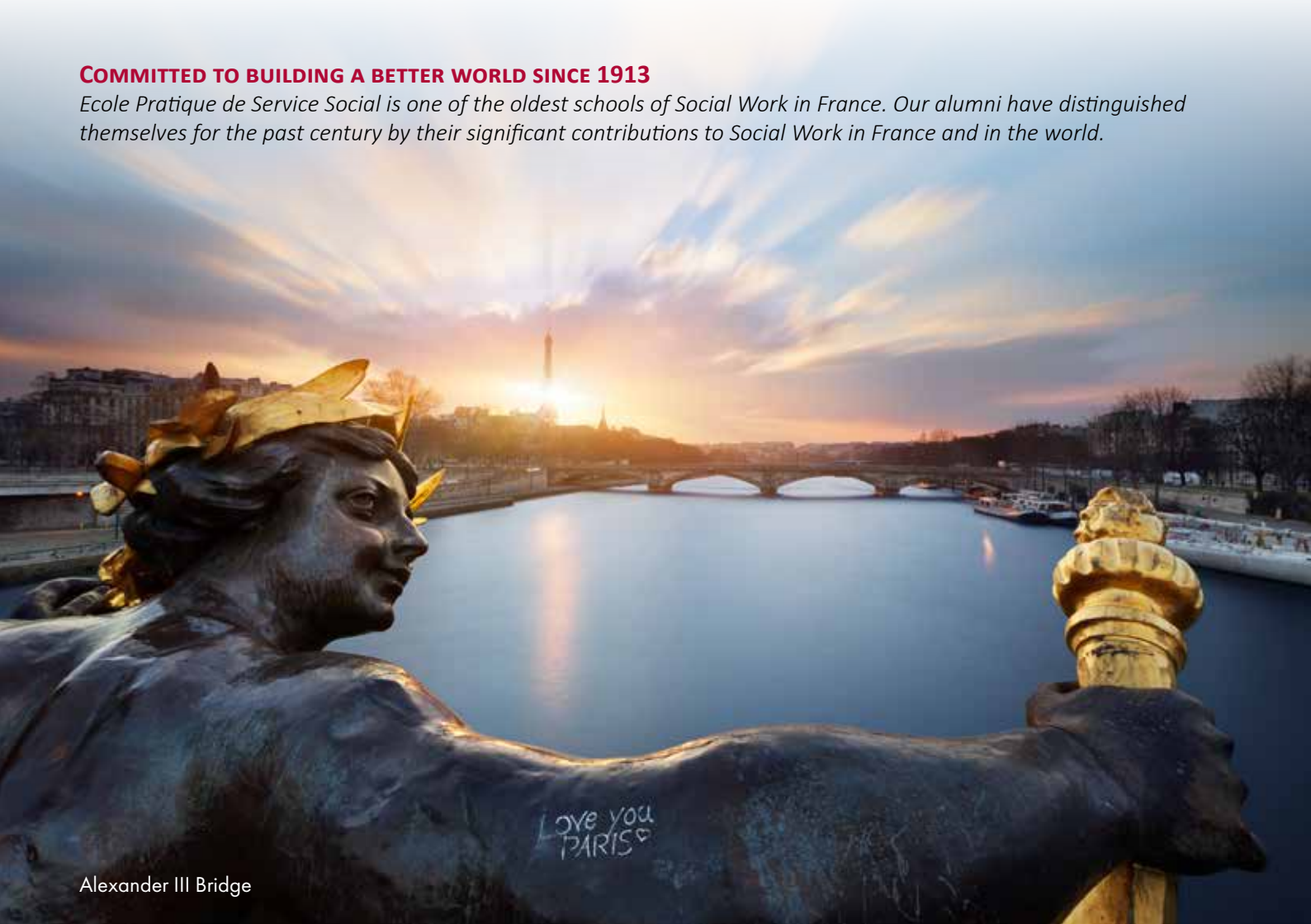
Alexander III Bridge

Ecole Pratique de Service Social is one of the oldest schools of Social Work in France. Our alumni have distinguished themselves for the past century by their significant contributions to Social Work in France and in the world.