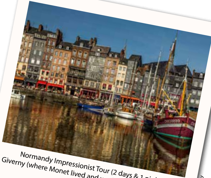
Normandy Impressionist Tour (2 days & 1 night) Giverny (where Monet lived and worked), Rouen, Honfleur, Etretat