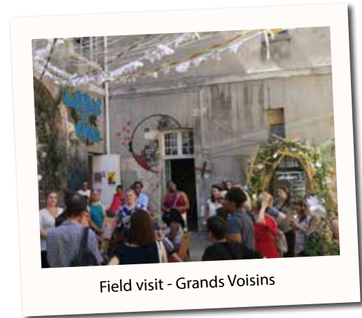
Field visit - Grands Voisins

If you are a faculty member travelling with a group of students, specific application guidelines and rates will apply. We will be happy to have you join us in some program activities and house you at the dorm. Please contact us well in advance, so we can help you prepare for the program with your students and network with French Social Workers too!