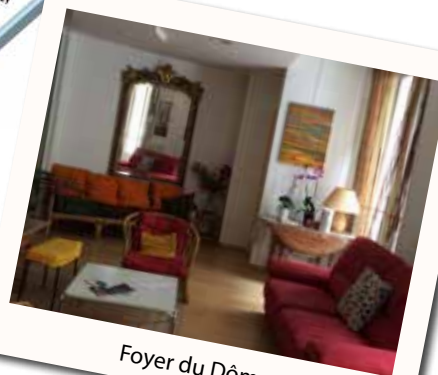
Foyer du Dôme