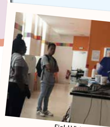
Field Visit Safe injection site