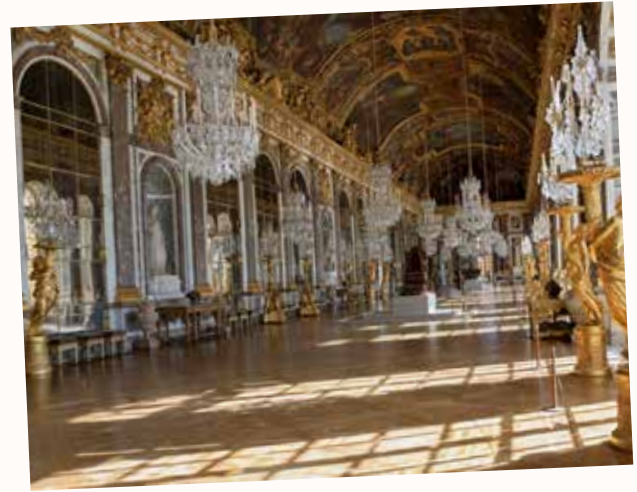
Versailles Tour (1 day) Castle, gardens, Petit Trianon, Grand Trianon

Experience two exclusive get-aways! Relax and discover the beauty of the French countryside at your own pace. Hotel, transportation and entrance tickets are included!