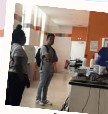
Field Visit Safe injection site