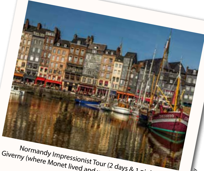
Normandy Impressionist Tour (2 days & 1 night) Giverny (where Monet lived and worked), Rouen, Honfleur, Etretat