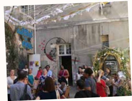
Field visit - Grands Voisins

All safety measures will be taking as indicated by French government regulations. Additional information and requirements may be released before the session begins.